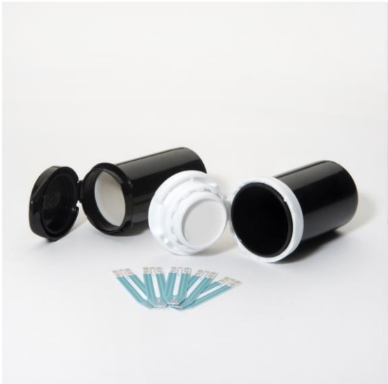
Airnov's dedicated diagnostic portfolio includes HAT®-SNAP, HAT®-IN and desiccant packets.

In the meantime, for further information on Airnov's solution portfolio contact the team or visit the Airnov website: www.airnov-healthcare.com/our-products .