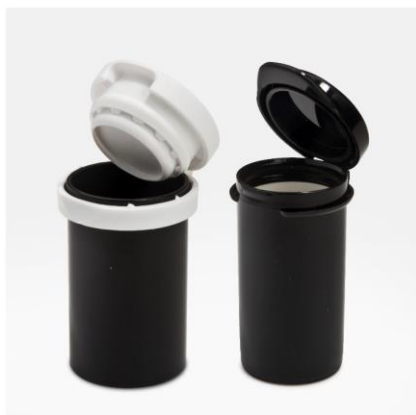
Vials for diagnostic market.