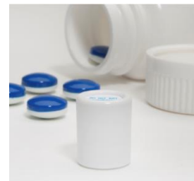
Pharmakeep oxygen scavengers are available in capsule and packet configuration

Pharmakeep® canisters & packets comply with US FDA & EU regulations for use in pharmaceutical and diagnostic applications, and are registered in a US-FDA Drug Master File.